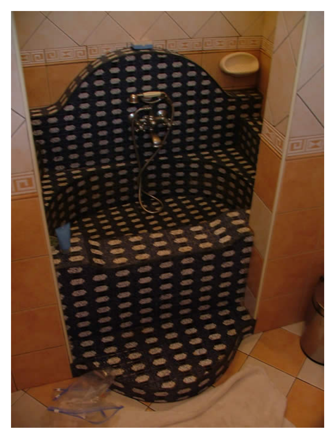
Our Zanzibar Bath - May 2013