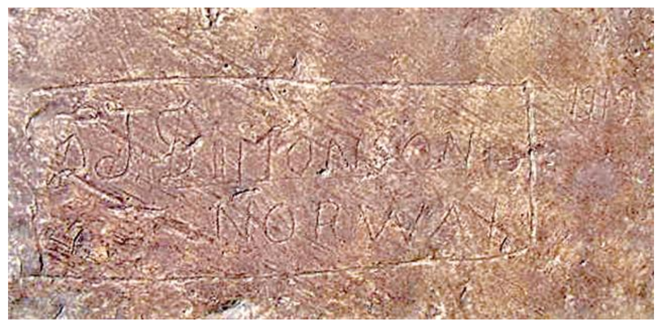
A close-up of the words inscribed in the boulder. Notice the date on the right.

This boulder, found sitting in the middle of the Carrot River with writing and the date 1912 chiseled into it, piqued the curiosity of the group who discovered it. They are hoping that somebody may be able to shed some light on the person who did the chiseling all those years ago.